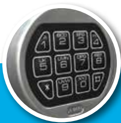
OPTIONS FOR AN ELECTRONIC LOCK