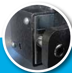
STAINLESS STEEL RETRACTABLE BOLTWORK