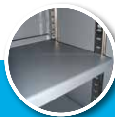
FULLY ADJUSTABLE SHELVING SYSTEM